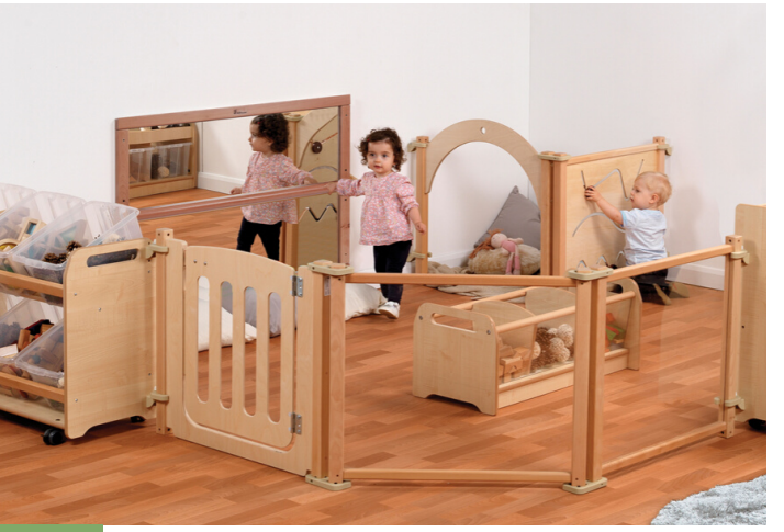
Panels can connect to furniture units for flexibility

If you are looking for further flexibility or some quick and creative solutions, here are a couple of suggestions to help achieve your desired flow and layout.